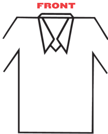
No Design Below Waist

FRONT: _____ BACK: _____ SLEEVE: _____ Clearly print lettering here also Clearly print lettering here also Clearly print lettering here also