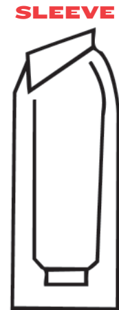
CIRCLE ONE Right Left

5 Cost Per Order Refer to price chart on next page.